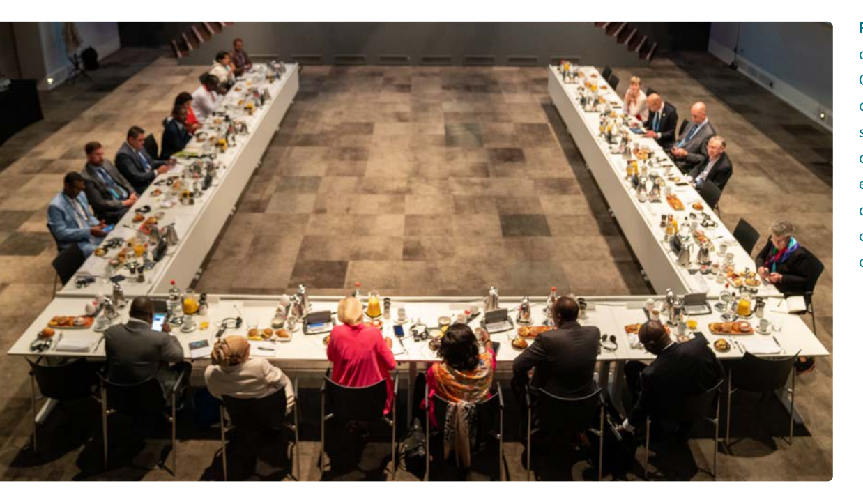
Photo: Higher level delegation meet for the Country Dialogues theme at All Systems Connect symposium, highlighting country voices, sharing experiences across countries on their WASH development agendas and solutions.