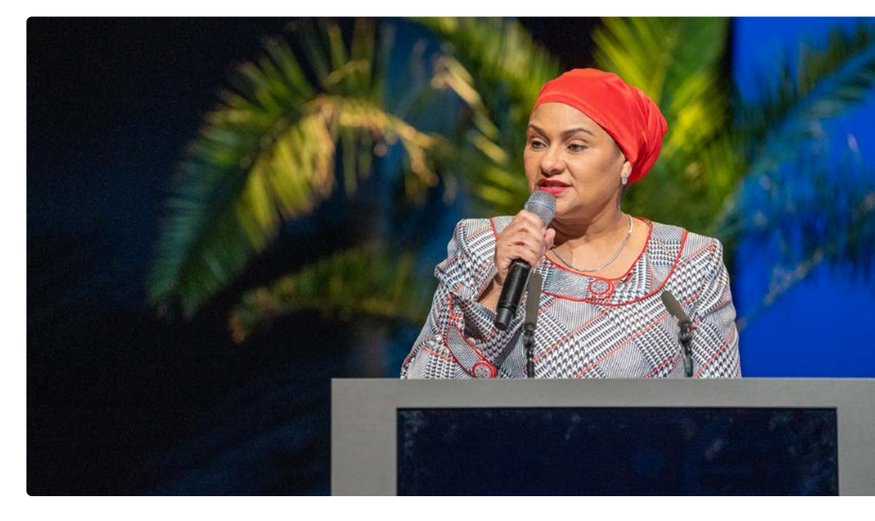
Photo: The Honorable Abida Sidik Mia Minister of Water and Sanitation for Malawi speaking at the final day of the All Systems Connect symposium.