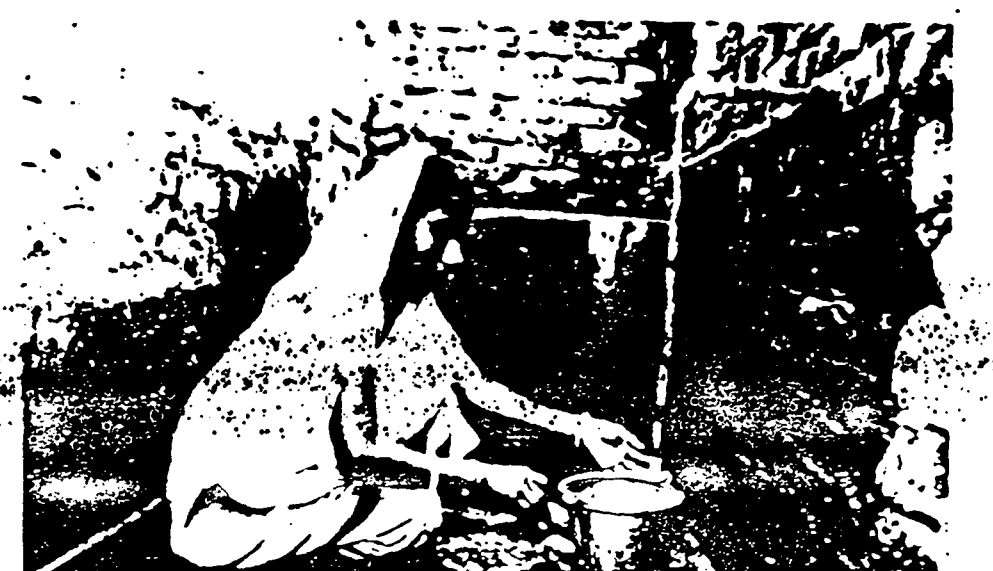
The water supply in Bombay, India, is intermittant and unequitable due to the phenomenal population growth of the city since 1950. Twenty-one percent of the population receive water for less than 3 bours each day.

One may become apprehensive about the quality of water when the supply is intermittent, restricted to a few hours in the day and night at poor pressures. During 1985-86, only 323 cases of complaints of contaminated water were recorded; maximum being once again from B Ward and the next case being C Ward. 307 contamination cases were