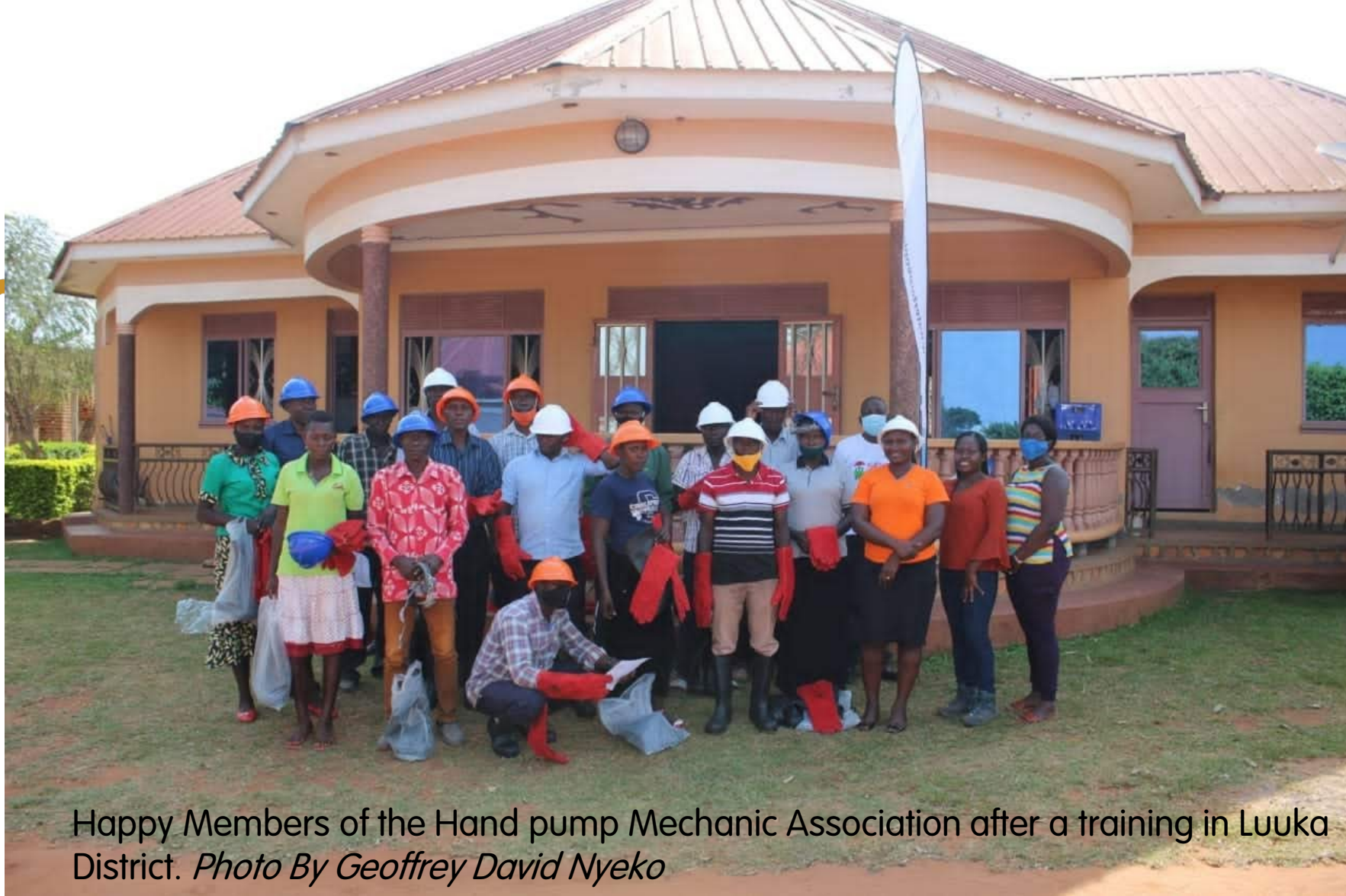
Happy Members of the Hand pump Mechanic Association after a training in Luuka District.