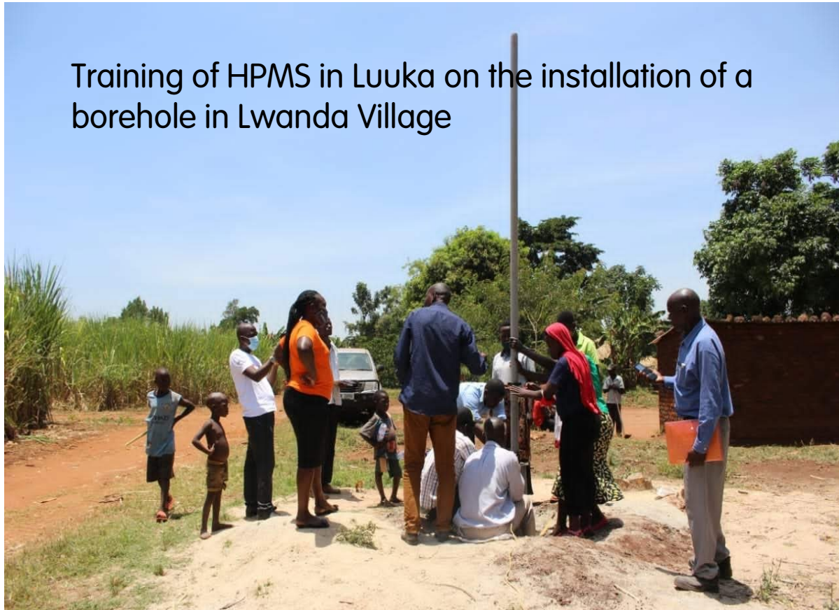
Training of HPMS in Luuka on the installation of a borehole in Lwanda Village