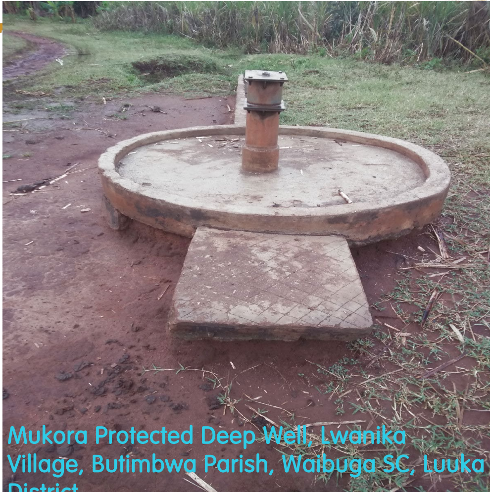
Mukora Protected Deep Well, Lwanika Village, Butimbwa Parish, Waibuga SC, Luuka District