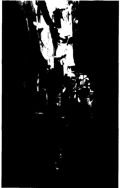
Difficult access in unplanned areas