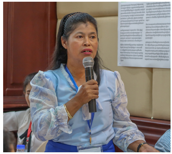
Leadership development civic champion

By the end of June 2023, 5 provinces have been declared ODF by MoRD in Cambodia. The Government continues to work towards achieving universal access to sanitation by 2025. Despite strong government commitment, the process is not without its challenges. One is moving up the sanitation ladder from ODF towards safely managed services. Another challenge relates to mobilizing sufficient resources to reach the last 2-5% of the population in each province. This is particularly difficult in places where there are no obvious low-cost sanitation solutions e.g., in floating communities living on lakes and rivers. Work is now underway with academia and a private company to pilot innovative technologies.