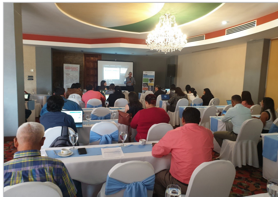
Sharing of PLANASA at PTPS Assemblies (PTPS Honduras)

At the start of the diagnostic and planning process, the technical secretariat of CONASA ensured that the Minister nominated a trusted technical expert who would provide a link between him and the technical work carried out in the committee. The committee had several meetings with this trusted expert to ensure that the Minister was briefed throughout, without being drawn into the details.