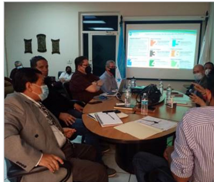
Submission and final approval of PLANASA by CONASA's Board of Directors in April 2022