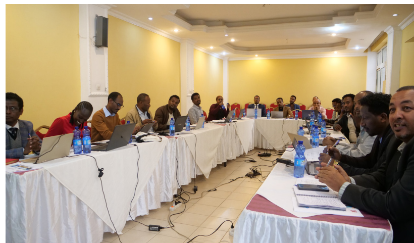
A national level training including universities undertaken in Bishoftu, Ethiopia (IRC WASH Ethiopia).