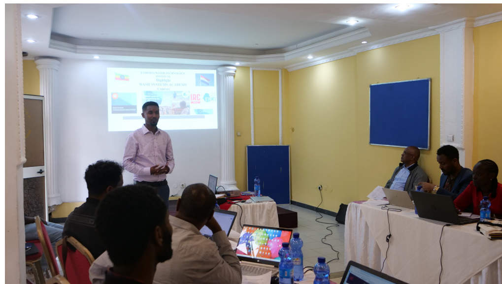
A national level training including universities undertaken in Bishoftu, Ethiopia (IRC WASH Ethiopia).

in Ethiopia, the key sector collaborators have built up trusted relationships between each other, often going back decades. Based on the personal and organizational reputation built up over time, and a strong network of sector experts and leaders, Lemessa is able to easily reach out to the right person – e.g., an influential decision maker - or to identify a training champion.