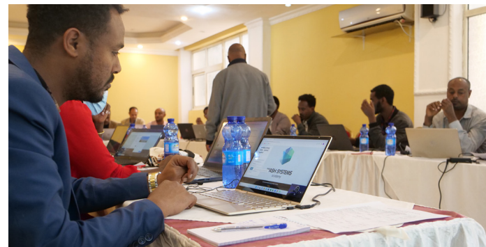
A national level training including universities undertaken in Bishoftu, Ethiopia (IRC WASH Ethiopia).