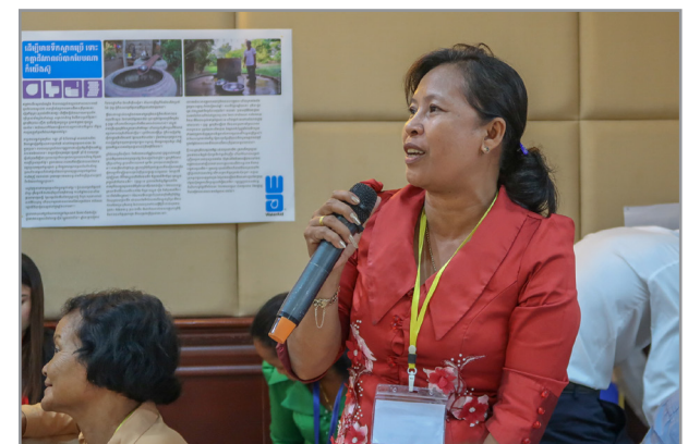
Leadership development civic champion

WaterAid and Agenda for Change partners are working closely with government to build a culture of learning around water, sanitation and hygiene (WASH) systems strengthening to bring about change from the local to the national level. Active government leadership acts as the backbone for change.