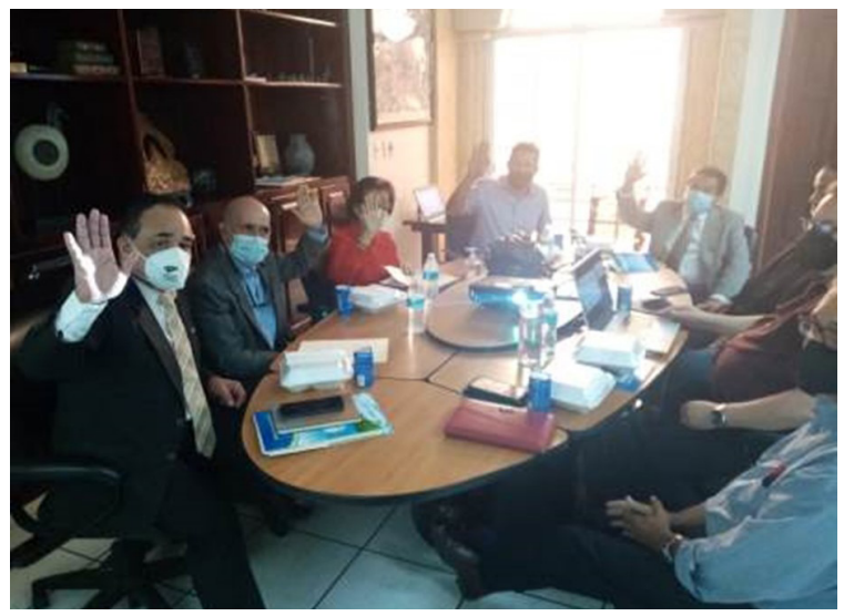
Submission and final approval of PLANASA by CONASA's Board of Directors in April 2022 (PTPS Honduras)

PLANASA II, the national plan for achieving the water and sanitation SDGs, is based on a systems strengthening framework with a focus on providing sustainable services. This is a stark contrast to the previous version of the sector plan which focused more on infrastructure development to increase services coverage. PLANASA II promotes the Human Right to Water and Sanitation and prioritizes climate resilience in response to an increased occurrence of adverse climate events in Honduras, such as cyclones. An in-depth and participatory analysis of the previous plan generated insights that equipped sector stakeholders to design PLANASA II. The joint engagement in the learning journey and the detailed documentation of sector needs has enabled more united thinking and action across government and development partners. For example, infrastructure development is now implemented with climate resilience criteria and accompanied by service provider capacity building so they have the necessary skills to translate infrastructure improvements into sustainable services.