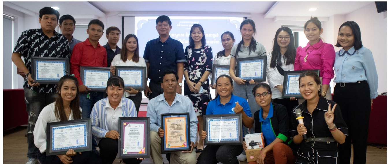
Media engagement in WASH sector influencing

WaterAid Cambodia invested resources in capacity building and model testing related to the learning and adaptation approach, which is hard to accommodate in traditional project funding.