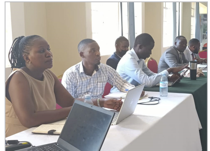
Participants gather for a data harmonization and reporting workshop on various tools, held at Water Resources Institute, Entebbe on February 12 - 15, 2023 (IRC WASH Uganda)