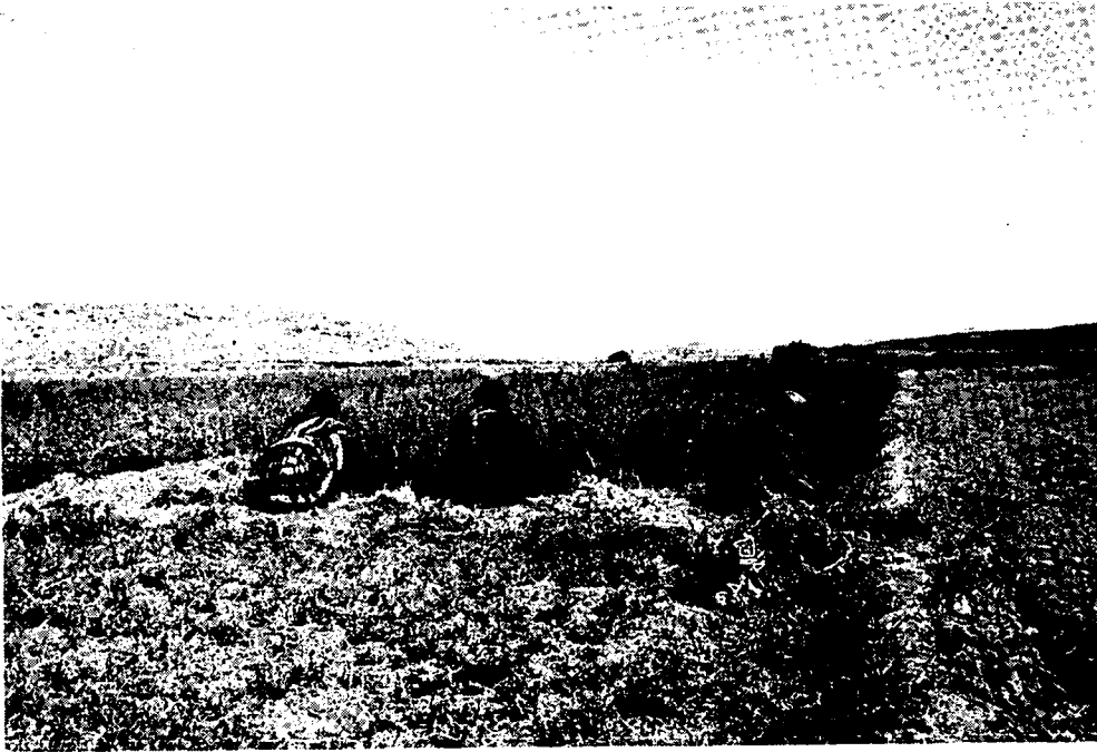
Figure 3 - Cutting alfalfa