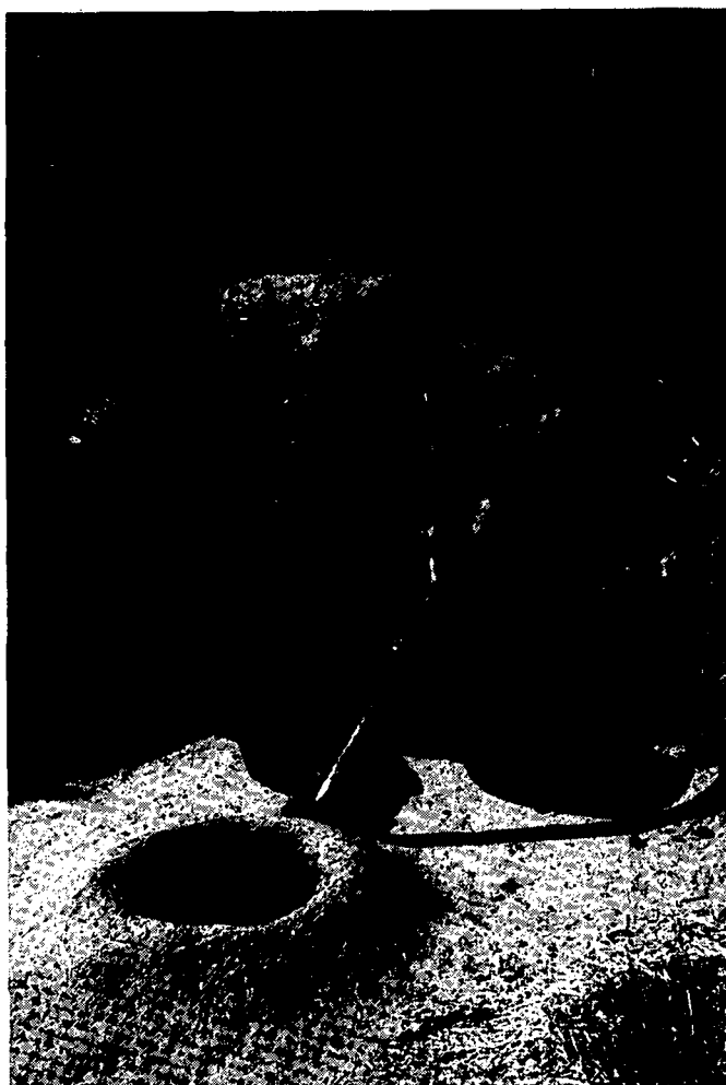
Fig. 5 - Churning buttermilk

Similarly, the RIRD P's goat programme has until now proved unconvulsive as the goats' milk production has gradually decreased. A serious evaluation and comparison programme between goats and cows' milk production should be made, also establishing processing possibilities for goats' milk.