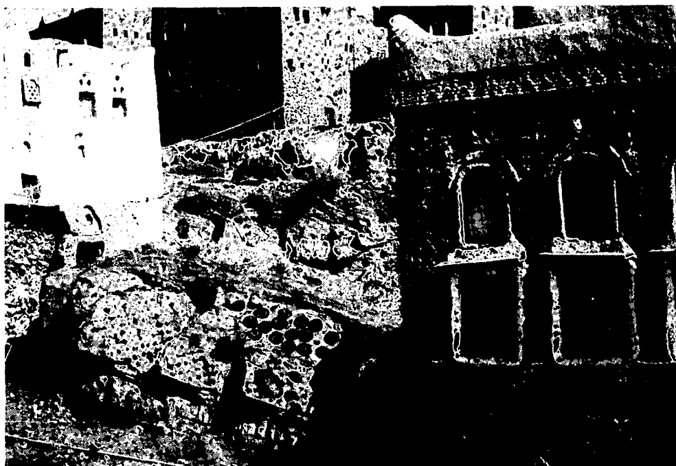
Figure 2 - Dung cakes drying