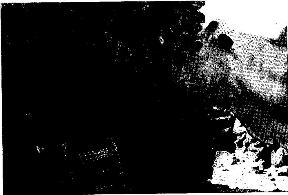
Figure 4 - Feeding a cow