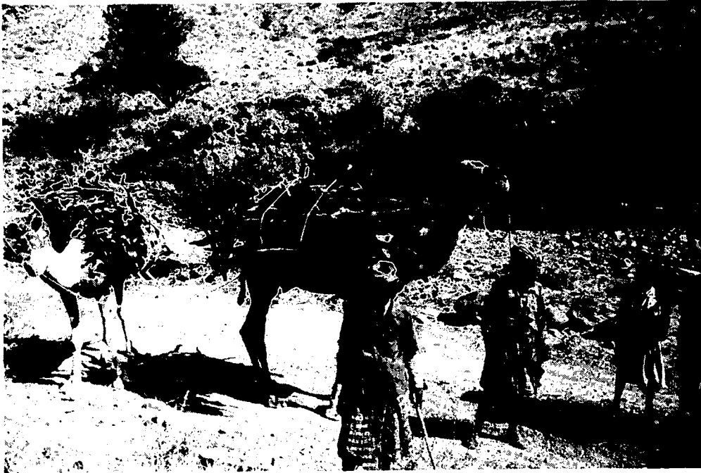
Figure 1 - Camel load of firewood

burners and oven are used, a YR 1300 pick-up load of firewood lasted 4 to 6 weeks as it is only used for bread baking; in contrast, in another household where the tannur is the main cooker, a YR 120 camel load of firewood barely lasts 5 days. Butagaz refills cost YR 50 in the villages, but YR 40 in Rada' itself; one gas canister lasts up to three weeks when used constantly as the main fuel as in 'Asara, but much longer when a gas oven is not used, and it is a secondary fuel (see Figure 1).