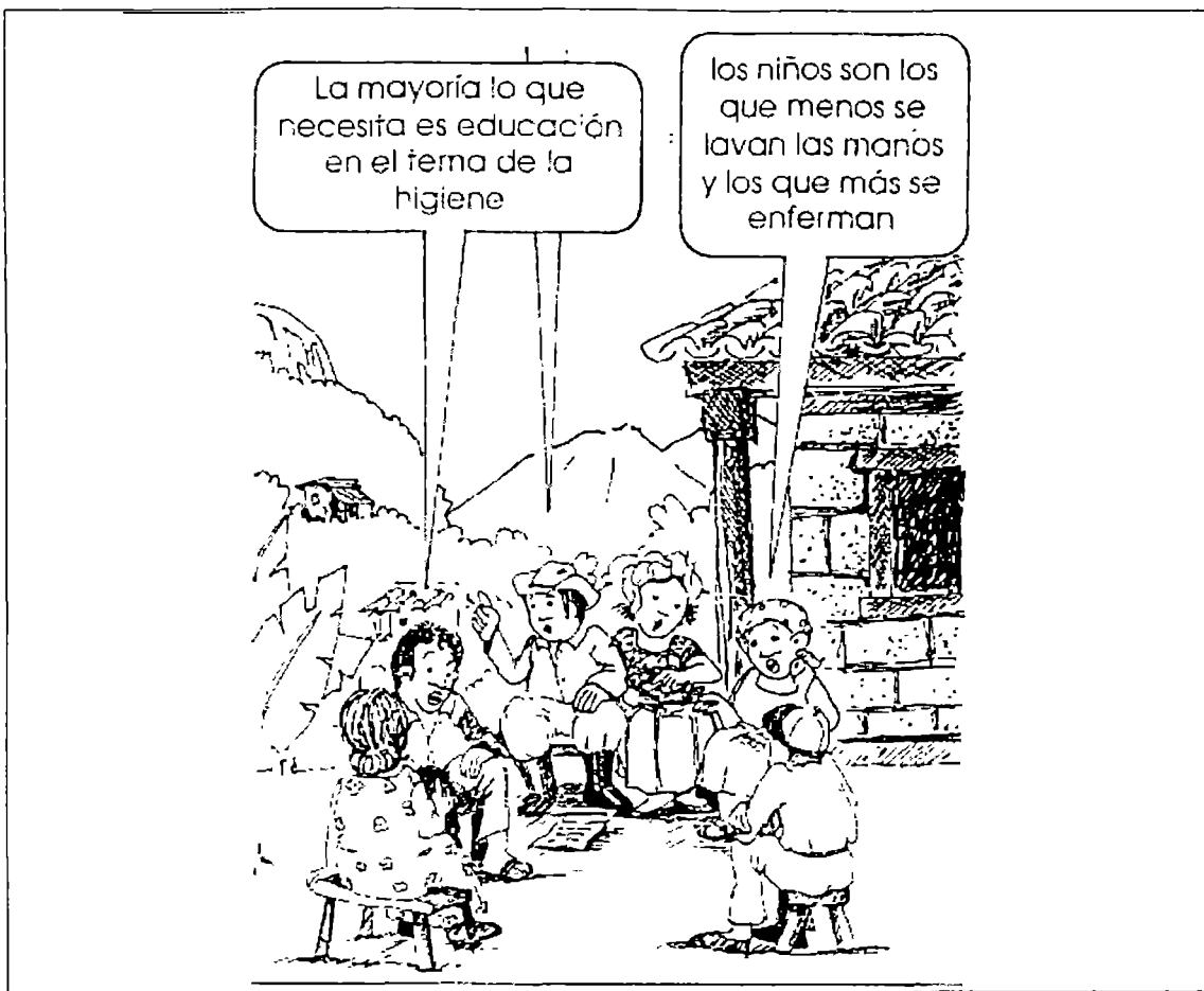
Fig. 2. Artwork in a training brochure of the Subregional Component

But as much as changing the traditional attitudes of men and women as portrayed in pictures might be a useful exercise, it is certainly far more important and meaningful to directly work to change the male dominance in the WES programmes.