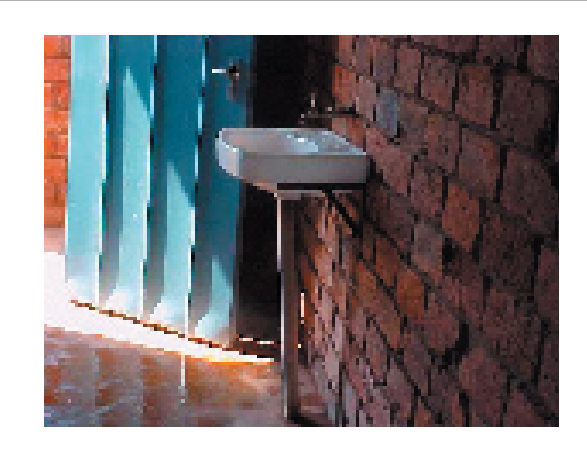
Photograph 1. Handwash facilities inside an ablution block

For a number 1, it is also more important for a woman to wipe herself afterwards, which then requires the disposal of whatever is used for wiping. A man however can shake off any residual urine.