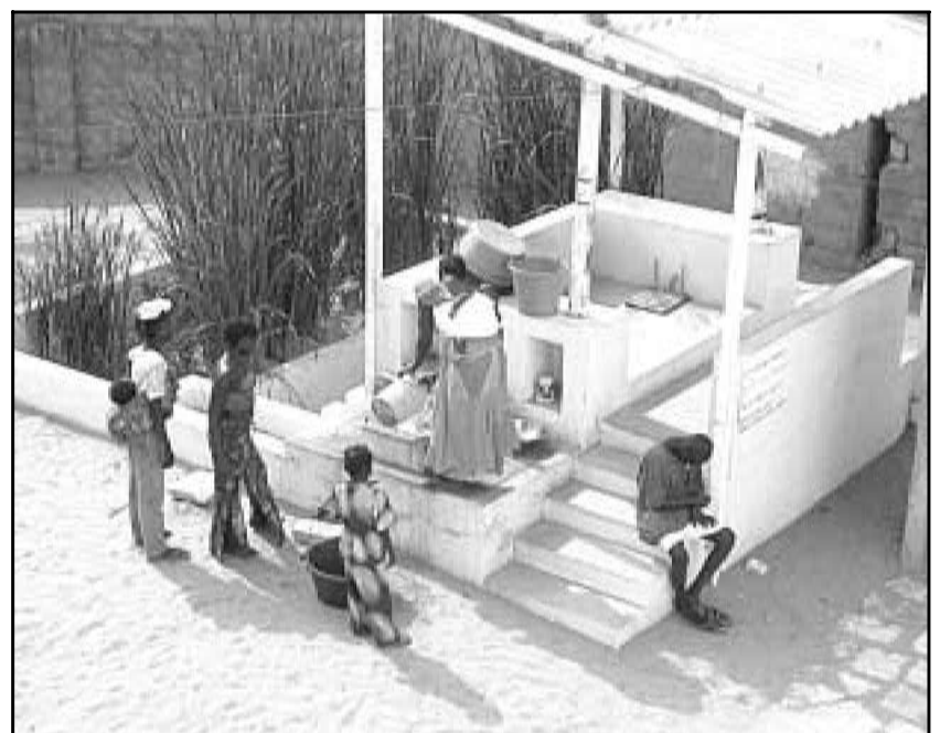
Pilot twin-bin net system with surrounding reedbeds, for sullage water and disposal of organic wastes. The sheltered area is used for laundry and food preparation. Currently serves 11 households for water disposal