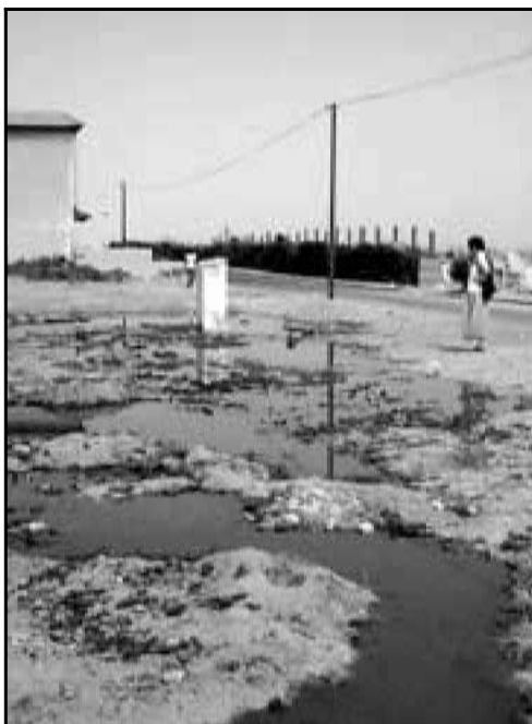
The conventional sewer that serves one corner of 'new' Yoff blocks frequently, spewing sewage into the streets (and see overleaf)

“Ecological sanitation systems need space, and open space is a vital (but with population pressure, unaffordable) element of community. Why not bring the two together?”