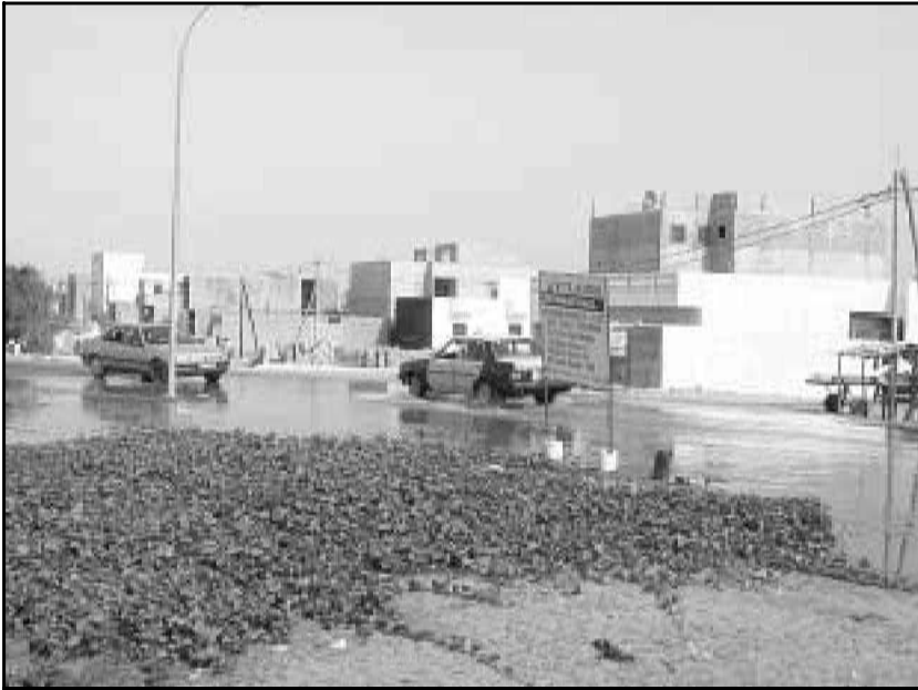
(Above and below) Sewage in the streets from the blocked conventional sewer.

environmental protection and regeneration, and community building.