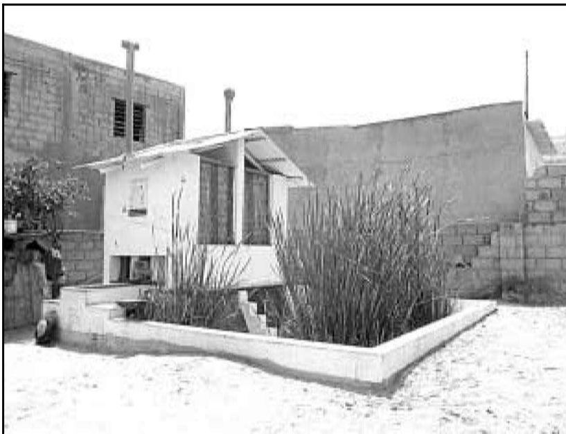
Pilot dry toilet/shower block, with double pit, and reedbeds for sullage water, urine and shower water – it currently serves a 21-person household

Based on community research, it also became clear that the Extension plan was incompatible with social and cultural practices. A US intern and Yoffois partner 3 had established that in the traditional village, community space is used for religious celebrations, baptisms, weddings, meetings, small-vendors, elders, and children. The network of pedestrian paths fosters continual social interaction and community cohesion. The Extension plan, with its long, straight streets, plots too small for courtyards, and lack of open space, undermines the active community life of the Yoffois.