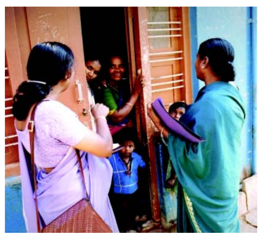
SDU staff and community leader visit each home to introduce the new BWSSB program.

This decision was later informally extended by the chief engineers to include ration cards, identity cards, election cards and even electricity bills, as admissible proof of occupation, because these documents state where the beneficiary lives. BWSSB was aware that this pragmatic resolution and its later extension was a courageous - and potentially controversial - break with previous practice. The tacit support of the state Urban Development Department was crucial; the Secretary of the Department was a member of the Board of Directors that adopted the initial resolution and did not object to later practice. Taking this administrative and bureaucratic route circumvented going to the State Legislative Assembly for approval, where the issue could have been bogged down in heated and