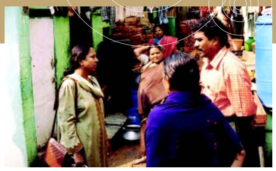
SDU staff and a BWSSB valveman debate how to improve water pressure.

In view of its responsibility to fund basic infrastructure within municipal boundaries, BMP decided to pay for the full extension of BWSSB's piped network to the new and partially-served wards. The Corporation agreed with the BWSSB's capital works division to divide the work