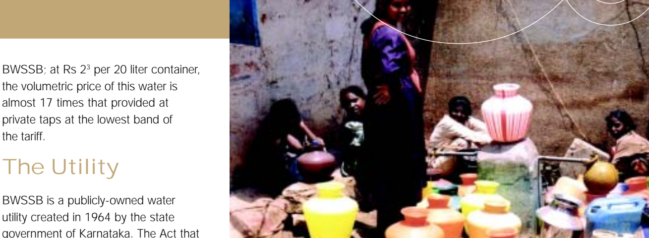
Women queue at a public tap, waiting for the water to be turned on.

the volumetric price of this water is almost 17 times that provided at private taps at the lowest band of the tariff.