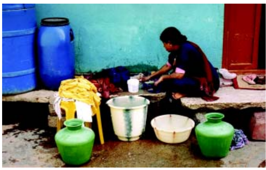
Household tasks are simplified after private connections increase water availability.

This development created a serious dilemma for BWSSB. It was estimated that water supplied by the utility to public taps amounted to a staggering 20 percent of all water going into the distribution system, and thus represented a very important loss of revenue if no one paid for it. Given BWSSB's mandate to operate on a no profit-no loss basis, and its ongoing struggles to reduce non-revenue water, it could not afford to continue the practice of supplying water free of cost. Initially, the Corporation gave tacit approval to BWSSB to disconnect the public taps over time, and it agreed to leave the matter to them. However, it was clear that a city-wide disconnection drive would incite large-scale opposition from the community, most likely with the support of the very councillors who had voted in favor