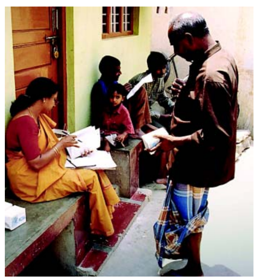
SDU staff distributes meters to households who have paid connection fees.

increasing the number of connections or improving collection efficiencies.