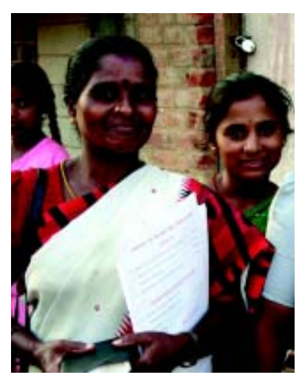
Community leader collects BWSSB application forms from residents.

First, slums provided an untapped market for engineers when they needed to increase revenue. Around the same time that the SDU was rolling out the slum program, senior management started increasing monthly revenue targets for service stations and demanded they be met either by