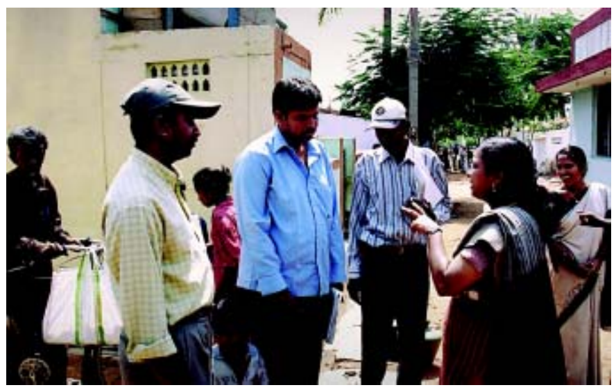
SDU staff meets with BWSSB engineers and contractors to discuss technical options for laying pipes in slums.

They went on to broker deals with BWSSB in five other slums, most of them locations where they had a long history of involvement. The SDU was able to engage with eight additional NGOs, many of which coordinated women's groups and thrift and credit societies which were also tapped to enhance community mobilization. This brought the total number of NGO partners for the 46 slums to 10.