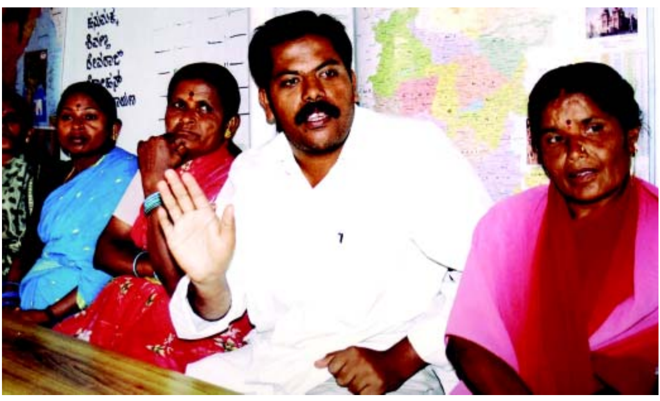
Representatives of a water and sanitation committee discuss how to improve revenue collection.

Retaining a key staff member from the pilot project, particularly one with training in community mobilization, was an important signal of BWSSB's new willingness to continue working with slums, and the value it placed on the knowledge and capacity built up during the pilots. Although the SDU was strongly supported by some members of senior management, it faced several organizational challenges. It was not given a budget or support staff, and consisted essentially of the single officer heading it.