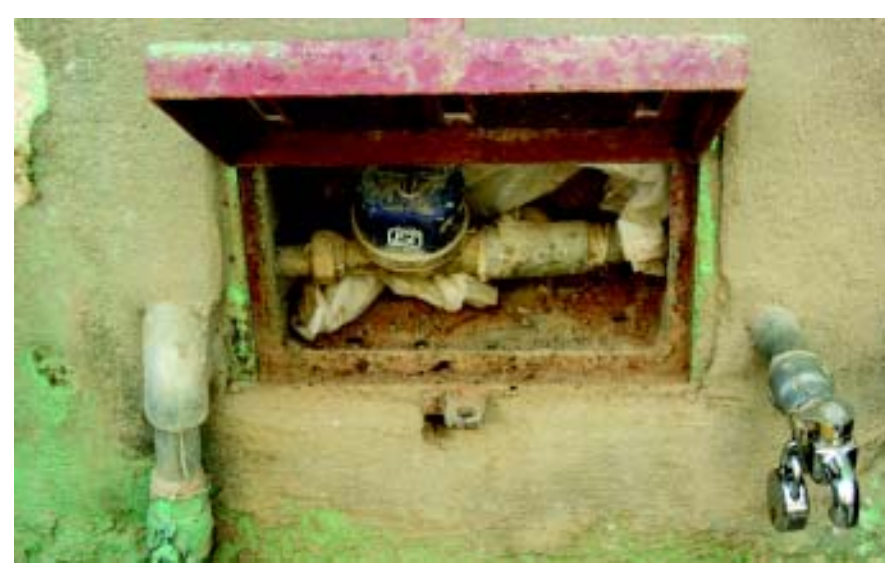
A newly-installed meter and outside tap locked by the household for private use.

Senior management stressed the regularization of illegal connections and high revenue targets motivated engineers to consider slums as untapped makets.