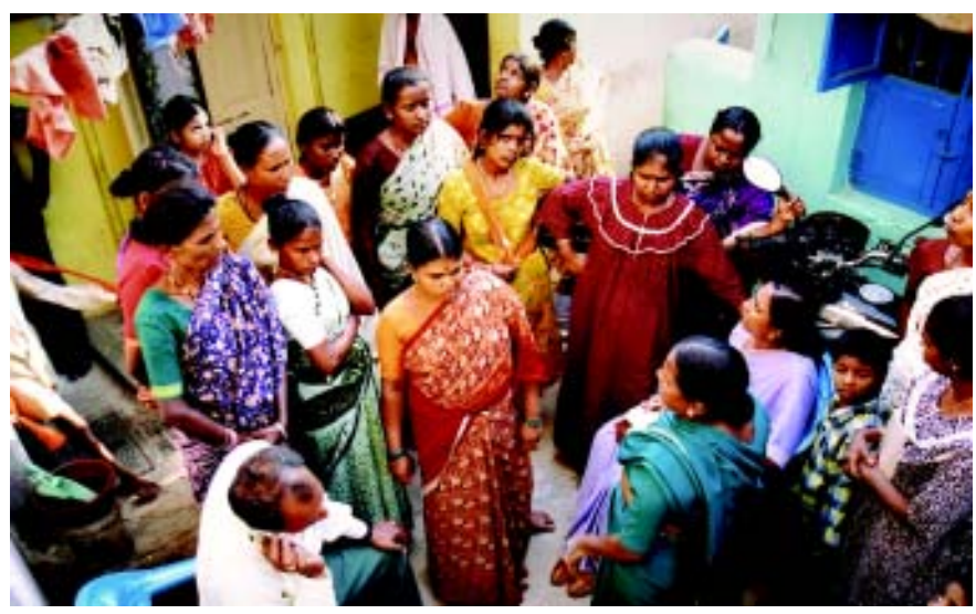
Community members gather to discuss whether to opt for shared or individual connections.

Three specific events prompted a change in BWSSB's overall approach to slums.