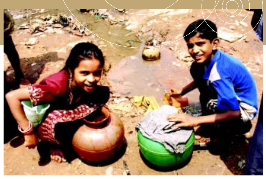
In an unimproved slum, children collect puddle water and filter it through a cloth.

In addition, an estimated 250 slum settlements were in areas of the city far from the main network. This was because the municipal boundary revision to include 27 new wards and