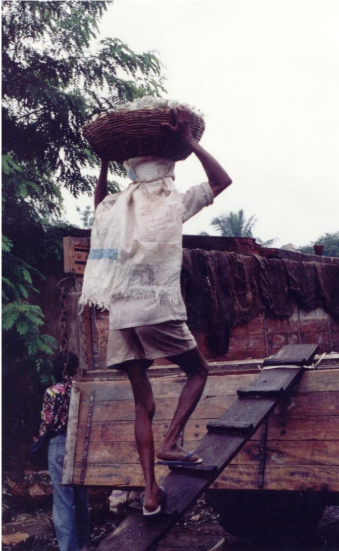
Photo 3: A man loading cullets on a truck in a wholesale enterprise in Bangalore.