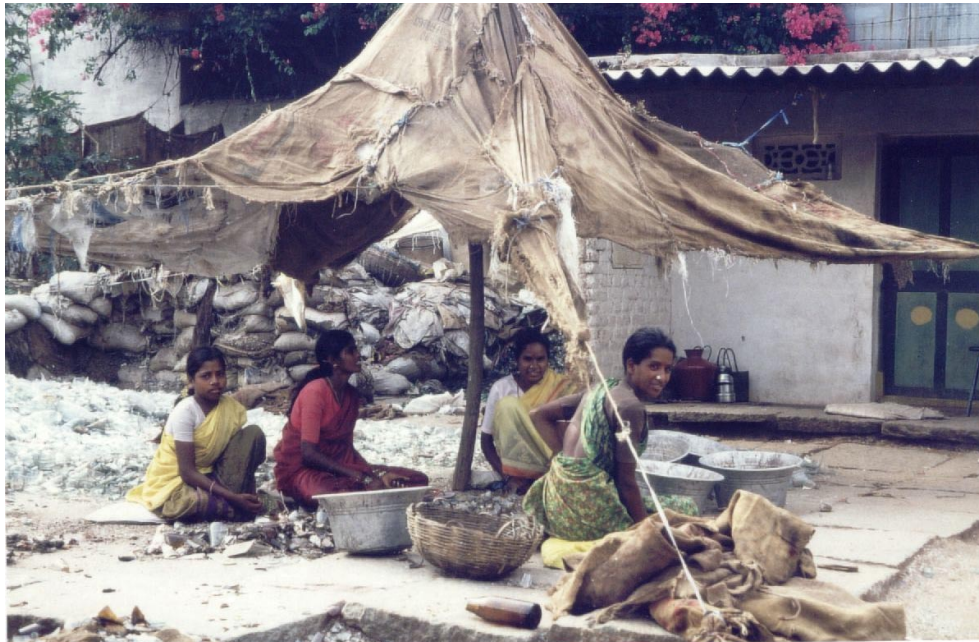
Photo 1. Women sorting cullets in a wholesale enterprise in Bangalore.