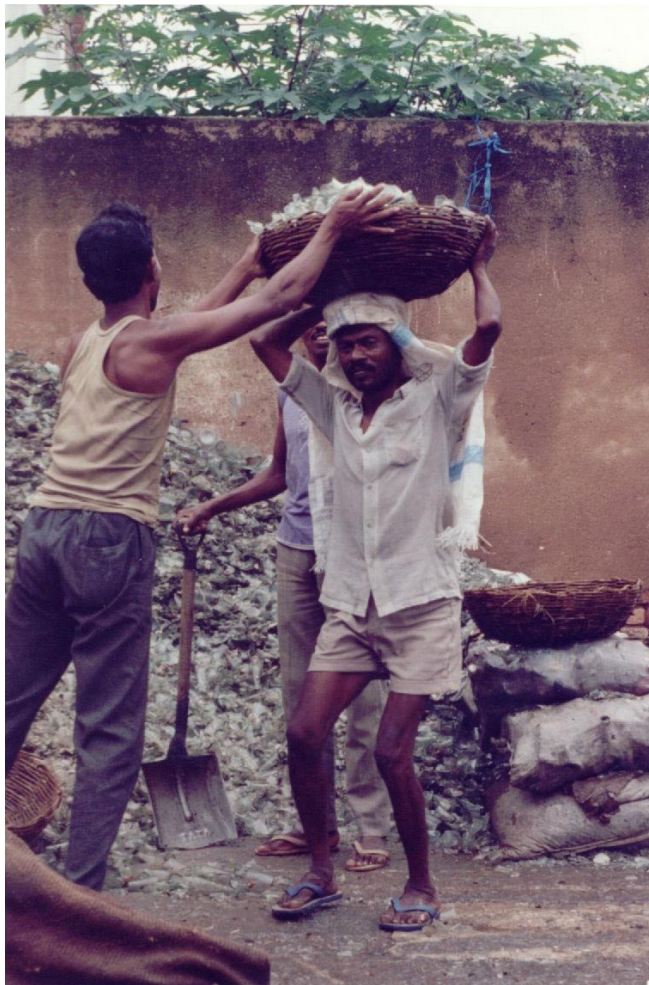
Photo 2: Men loading cullets in a wholesale enterprise in Bangalore.