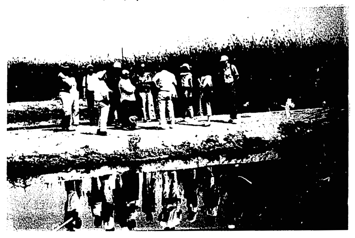
No. 4 During a field trip to the U.S. Bureau of Reclamation facilities at Hemet, California, participants discussed vegetation types used in wetlands wastewater treatment.

No. 3 Workshop participants learned about the use of salt-tolerant plant species while on a field trip to a constructed wetland site at a U.S. Bureau of Reclamation piiot project near San Jacinto, California.