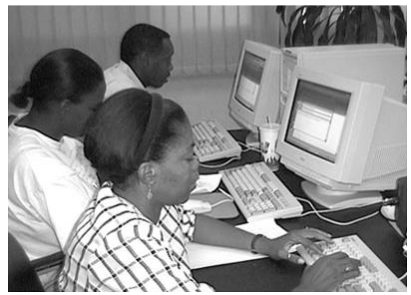
Jamaican staff of the National Family Planning Board applying new skills online

The entry of women in the new technology service sector is recent. However. iobs are numerically fewer than those that had been created in manufacturing. only Not are there fewer jobs, but the women who have lost manufacturing iobs generally not