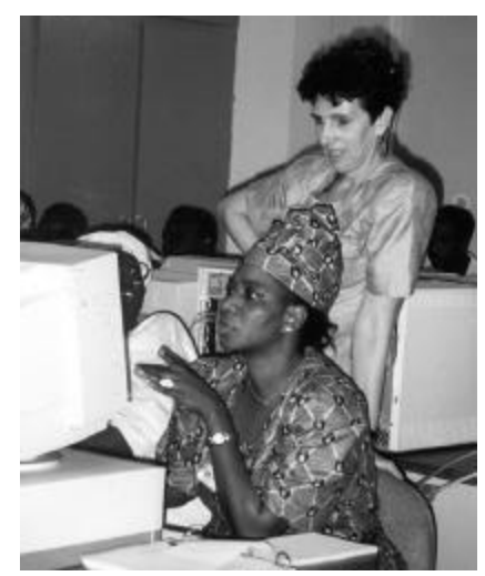
Through the Leland Initiative in Mali, women acquire computer skills

While IT policy must be gendered, gender policy, too, must be aware of the opportunities and challenges that IT brings. These two policy and gender groups need to be aware of each other and work together. Women have a great deal