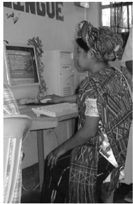
A student teacher at a bilingual educational technology center in El Quiché, Guatemala

IT can also help empower women through codification and dissemination of their indigenous knowledge. As gender roles root women in their communities, they are particularly aware of their social, economic, and environmental needs. Traditionally women have been the incubators and transmitters knowledge relating to food processing, preservation, and storage, the growing of specific crops, nutrition, and health. Much of the knowledge that women in rural areas possess has scientific value. IT can help organize and transfer this knowledge to outside communities that might benefit from it.<sup>257</sup>