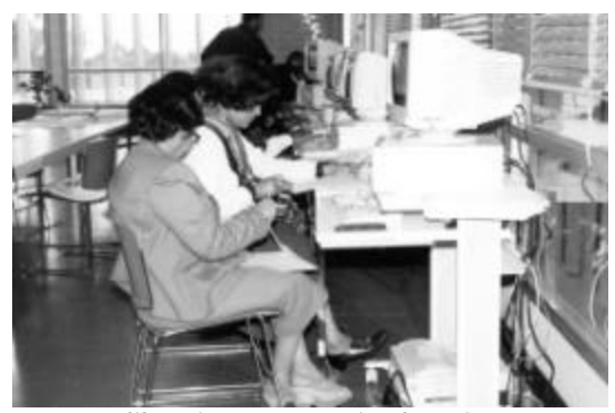
Women librarians at a United Nations Economic Commission for Africa session learn Internet searching techniques

The single most important factor in improving the ability of girls and women in developing countries to take full advantage of opportunities offered information technology is more education, at all levels from literacy through scientific and technological education. Such improvement requires interventions at all levels of education. First, the concentrated efforts of the past ten years to ensure girls' and women's access