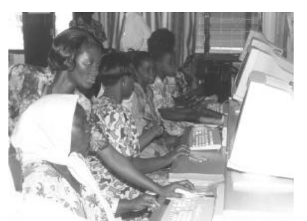
Ghanaian women train to use computers and the Internet at a USAID-supported community

The major information needs of small businesses in developing countries are for information about supply (obtaining inputs), demand (new and existing customers), finance (business management and obtaining additional finance), the environment in which they are doing business, and skills. They tend to rely heavily on informal information (from friends and family) that may be inaccurate. While too much reliance on formal information also has its drawbacks, the businesses need to access formal information to balance the sources from which they draw. Web sites can provide information about the business to potential clients, as well as sell products and services. Information technology can reduce administrative costs, speed up business transactions and link local businesses with supply chains. "Promoting E-