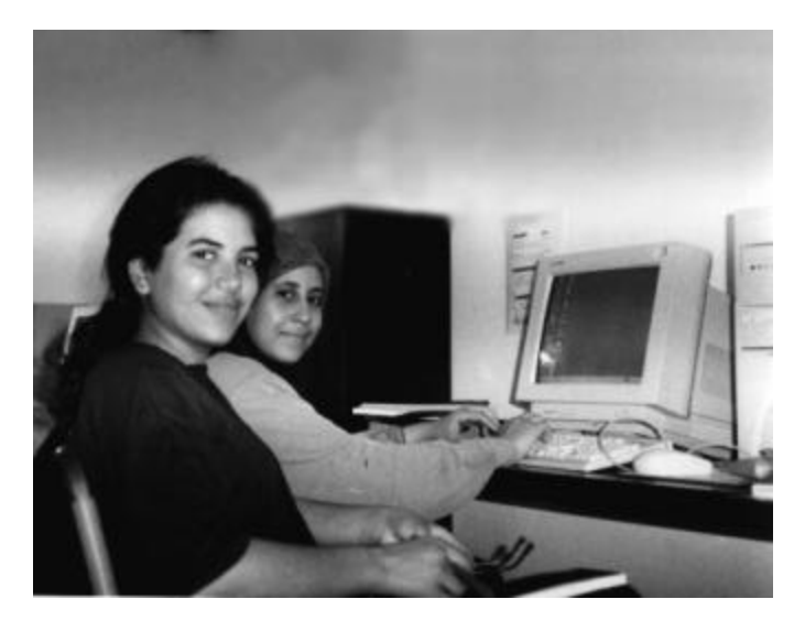
Moroccan student teachers in Ouarzazate