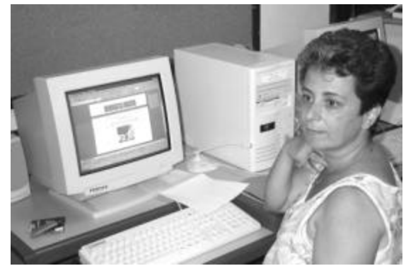
A Brazilian teacher in an USAID-supported LTNet program networks with colleagues

Worldwide, women are putting IT to work for the movement [for women's rights and empowerment]; communicating among dispersed networks, mobilizing action in times of crisis, participating in policy debates and voicing new perspectives.