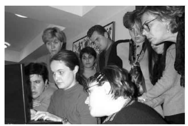
Romanian social workers learn how to access the online course "Foundations of Social Work."

More job opportunities may exist for women in IT education and training, as education is traditionally a female field, and the flexible hours of a trainer may appeal more to women with families. Interviews with women participants in a networking training course in India highlighted women's interest in applying their technical skills as trainers rather than as technicians in the industry, due to the trainers' more flexible work schedules. This follows the pattern emerging in South Africa, where women are most represented in IT education and training (39 percent) followed by sales and marketing (36 percent).