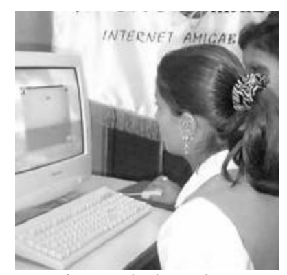
A student surfs the web at a neighborhood telecenter in Asunción, Paraguay

becomes more tightly linked with the development of knowledge economies, education for young women becomes more and more important. The low literacy rates of women in Africa are barriers to women's advancement in jobs associated with information technology as well as in their use of the technology. In the transition economies of Europe and Eurasia, economic liberalization is occurring and along with it, more new jobs using information technology appearing. Since they are well educated, women in these countries should find themselves well placed to take many of these jobs. However, the withdrawal or