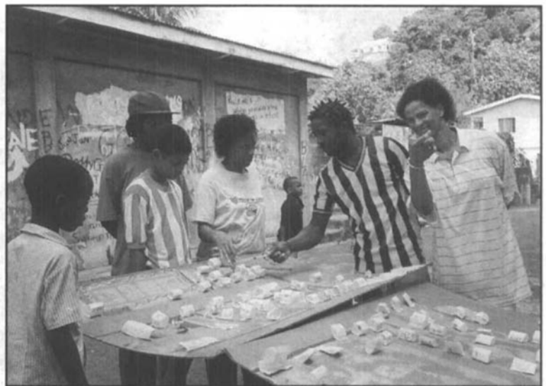
Community involvement in problem-identification in Rose Place.

At an initial meeting organized by CDD to address this situation, local people were angry, sceptical, and apathetic. They wanted to see quick, visible results — especially in terms of new toilets and dealing with garbage disposal — but they were reluctant to volunteer for the self-help initiative. There was a feeling that the facilities would be quickly vandalized by the ghetto youths who were not present at