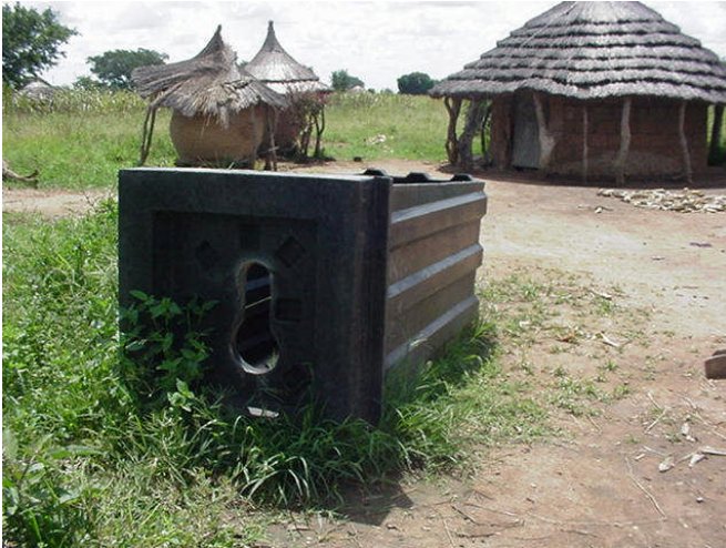
A mobile toilet supplied by the district during emergency days lies on its side, unused in one