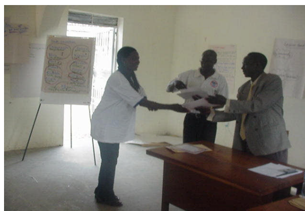
The District Director of Health Services hands over a certificate of attendance to one of the staff who attended the CHC training.

Status of sanitation after seven months of intensive education and follow up.