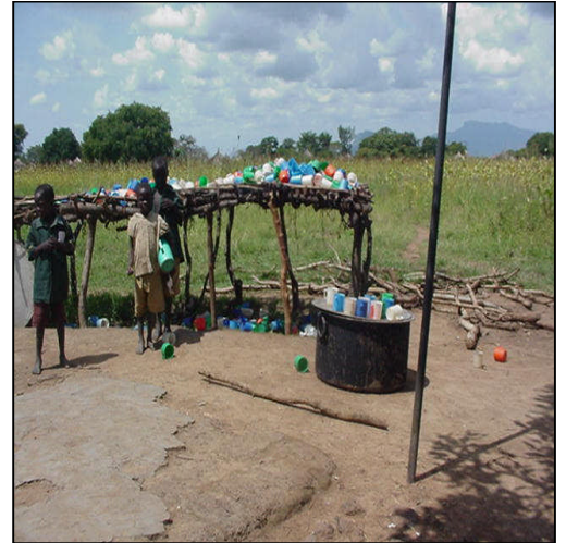
A drying rack at a primary school not properly used – note the cups lying on the ground