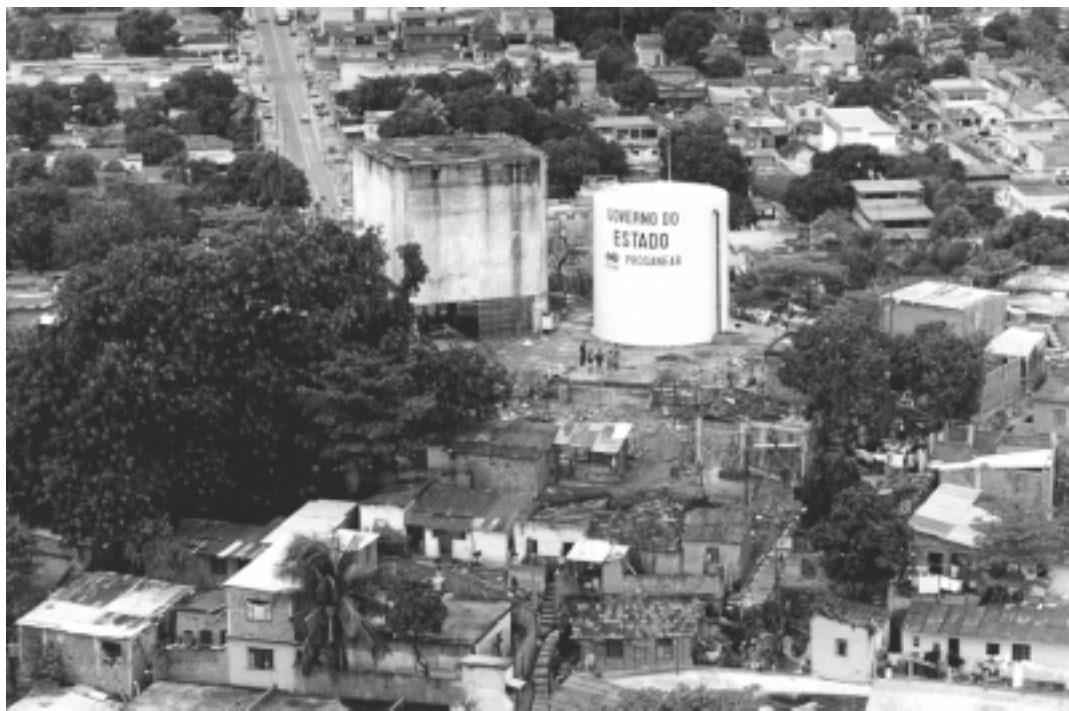
Morro União: 500 thousand liter metal reservoir

PROSANEAR began slowly and improved with experience. This experimental phase clearly demonstrated the power of combining community participation and low-cost technology. Residents learned they could work to improve their own communities, water companies learned that favelas make good customers, and governments learned that innovative solutions can work. The next round of projects will be even stronger thanks to the knowledge gained in the first round. There is every reason to hope that PROSANEAR's pragmatic combination of low-cost technology and community participation will enable water agencies to serve millions more of the urban poor, in Brazil and around the world.