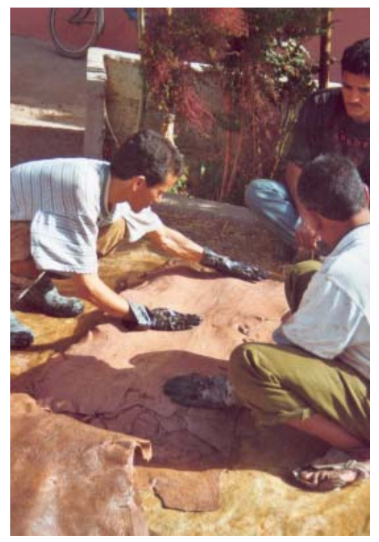
Figure 1: Small-scale leather processing in Morocco

80-90% of the world-wide tanneries use Cr (III) salts in their tanning processes. In some parts of the world, the Cr (III) is obtained from Cr (VI) species, which are a hundred times more toxic, but generally tannery effluents are unlikely to contain this form.