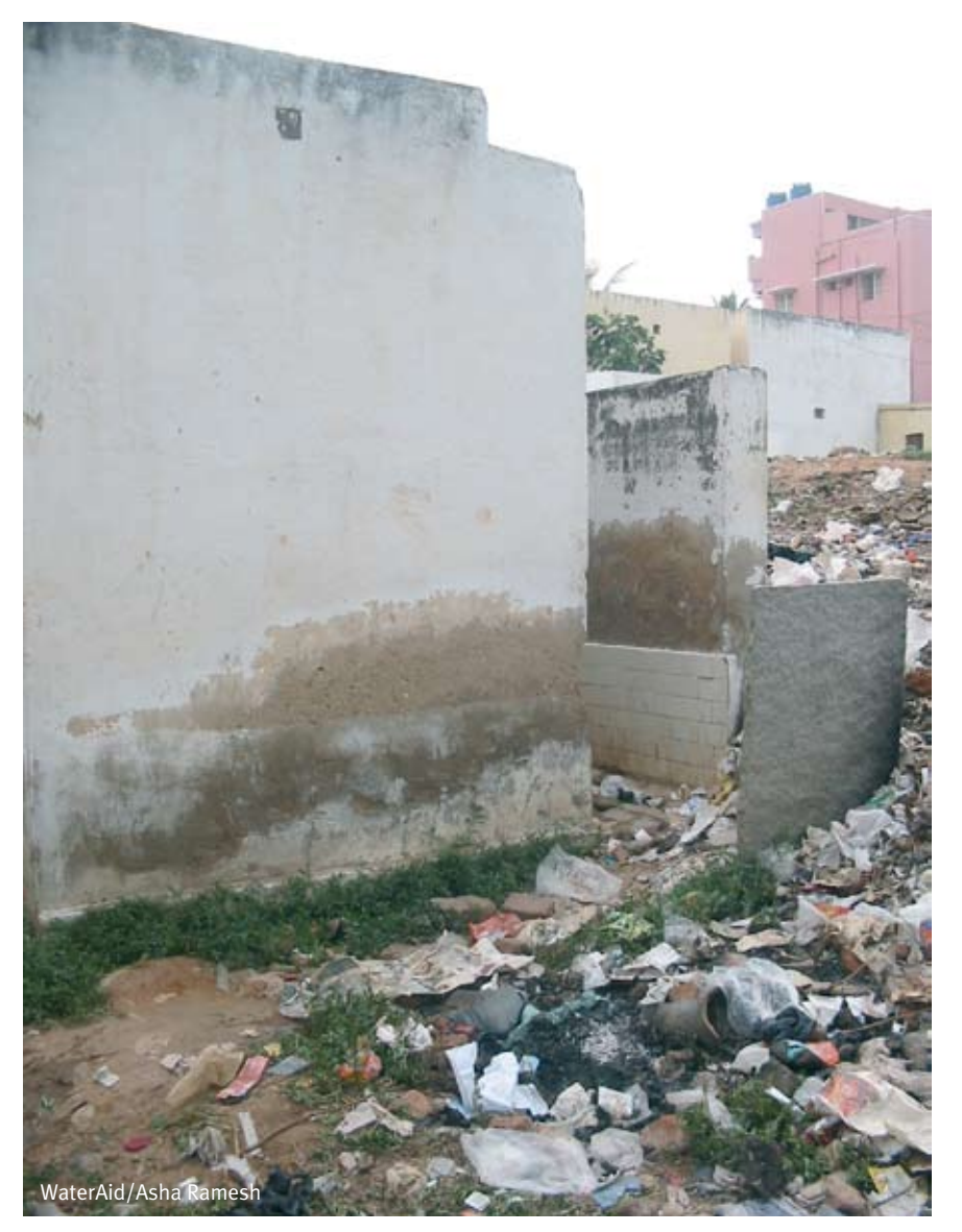
Photo: An open defecation community toilet, Nellore Puram, Karnataka.

20The Vision Document is the official submission by the state government of where it sees the state by 2020 in terms of development; it provides the basis of forward planning in the state.