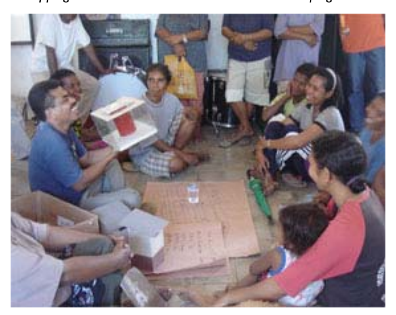
Project staff promoting pit latrine with low cost