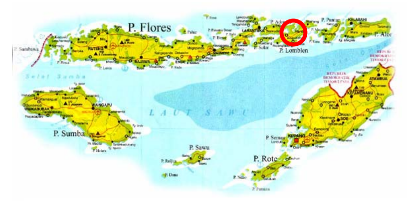
Map of project location