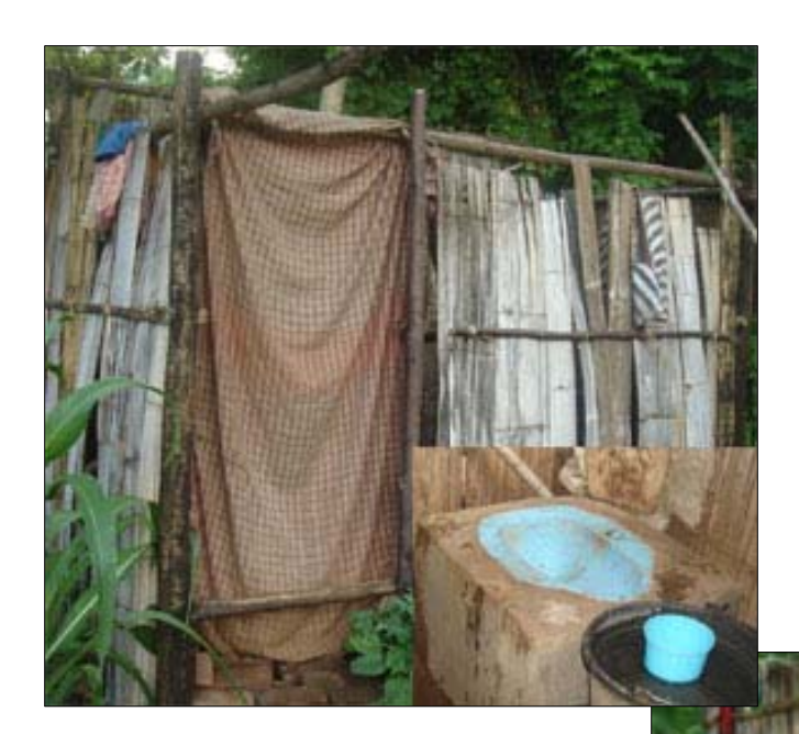
Community home latrine after project implementation