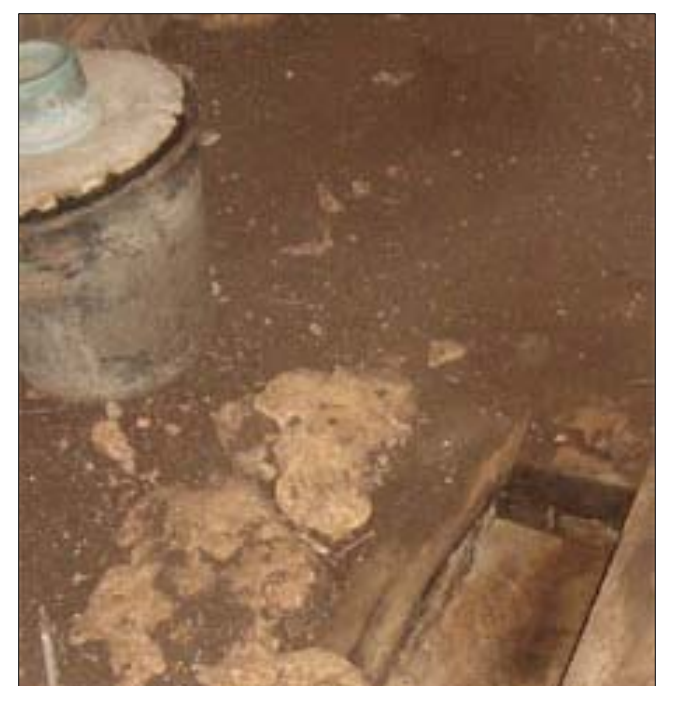
Community home latrine before project started