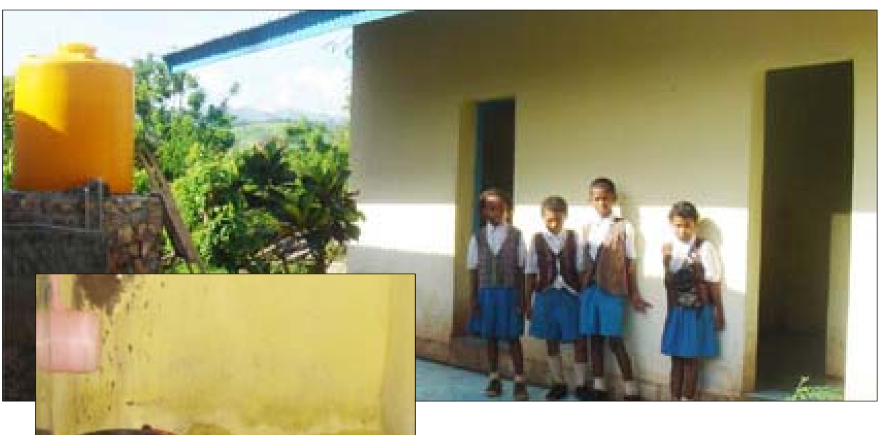
Water system and school latrine