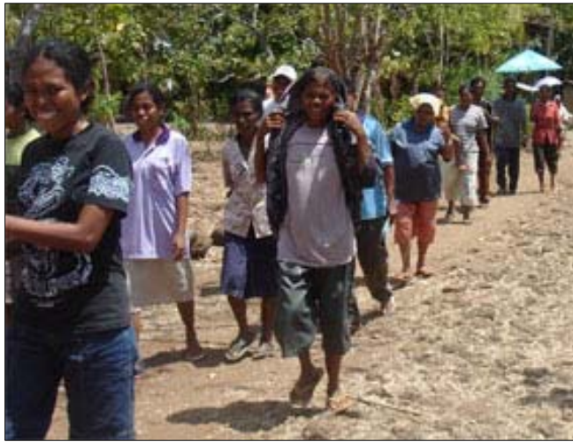
Mapping and transact walk at Total Sanitation Campaign activities