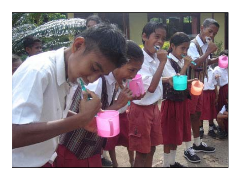
Hand washing facility and Hygiene practices campaign at school level