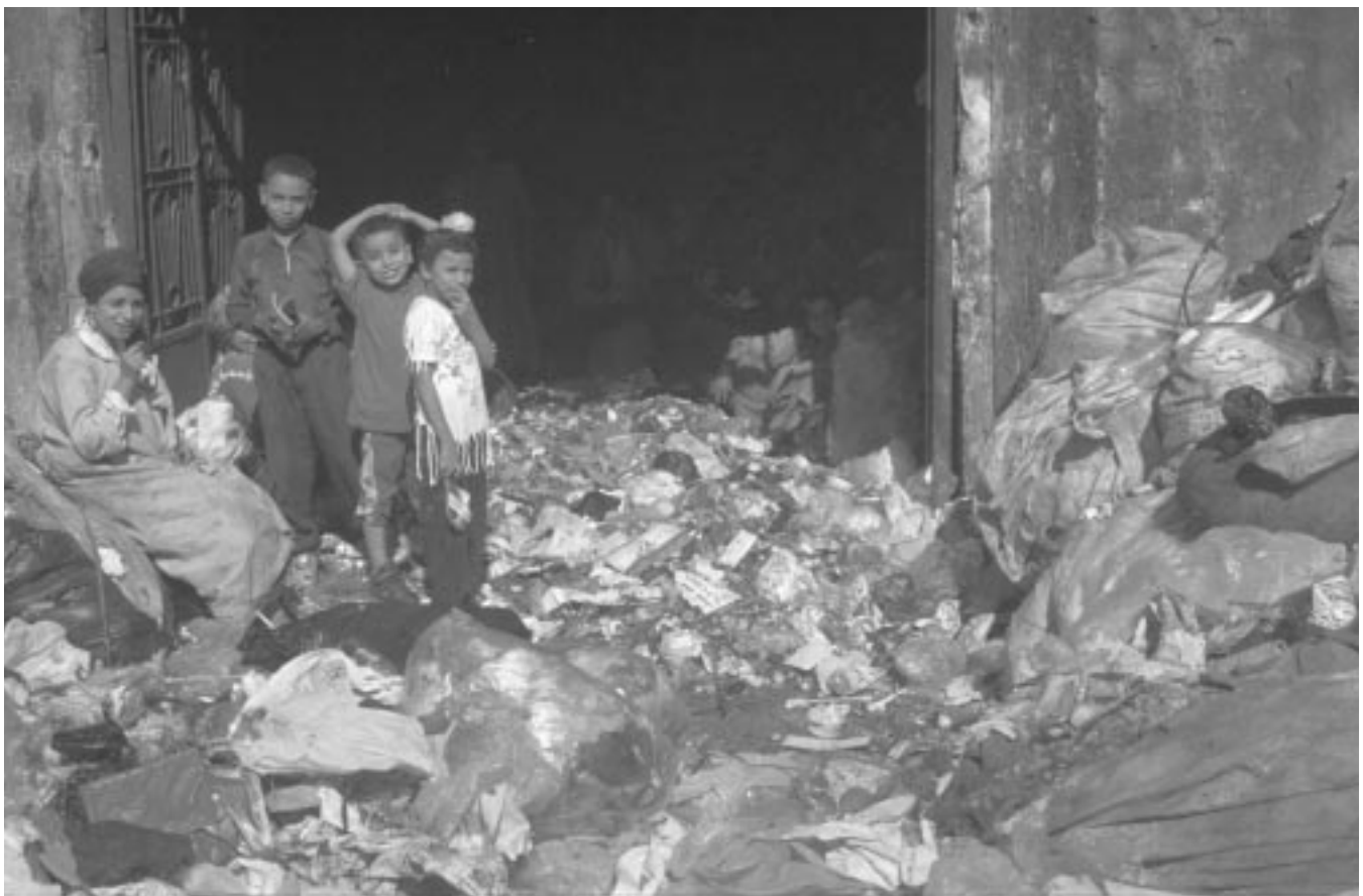
Photo 4. Family labour in Moqattam, Egypt.

Because these are essential to understanding the role of MSEs in the labour market, the following distinctions are made: