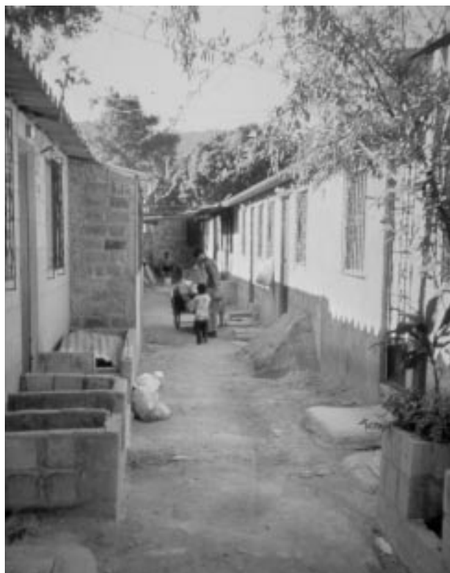
Photo 2. Child bringing waste to waste collector, El Salvador.