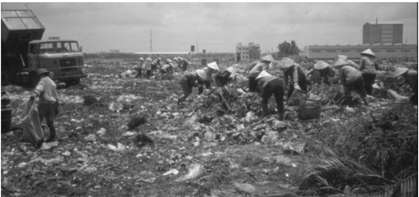
Photo 3. Waste pickers at a dumpsite in Hanoi, Vietnam.

In addition to MSEs and CBOs, the term 'informal sector' also includes waste pickers and itinerant waste buyers. Both of these terms refer to individuals – including children – who support themselves and their families by taking materials out of the waste stream for their own use and to sell. In our vocabulary, waste pickers are usually salvaging or being given the materials, while itinerant waste buyers are usually buying them in a semi-formal arrangement from families.