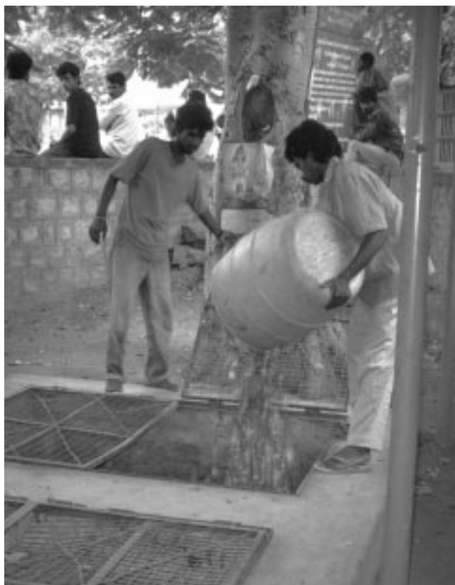
Photo 1. Household waste in the South consists of mainly organic material.

Given the high density and moisture content of this waste stream, compactor trucks, the standard in the North, are virtually useless in collecting this waste: it is already so wet and dense that compaction during collection makes little difference and may force liquid out onto the street. The operating costs for the compacting vehicles raise the baseline collection costs beyond the ability of many clients to pay.