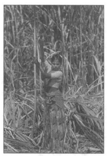
Sugar-cane cultivation in Tamil Nadu

Indigenous systems of water management evolved highly complex mechanisms to ensure equitable water distribution in spite of unequal landownership. The solution to man-made water scarcity, as well as the conflicts that such scarcity generates, lies in recognizing that water is a common resource and can be sustainably and equitably managed only on the basis of collective control and decision-making - in which women play a full part.