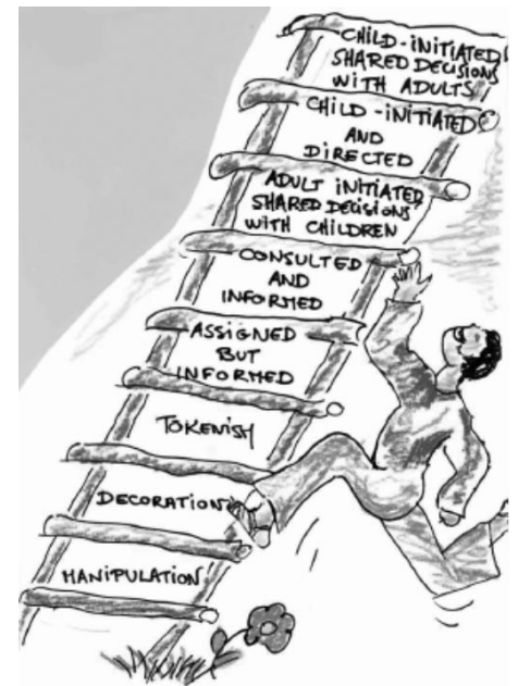
Ladder of increasing child participation.