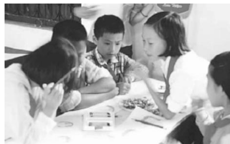
Children assessing the latrine at Mau Son primary school.

To sum up the approach, children are not just the beneficiaries who justify our actions in providing sanitation. They must become real partners and be fully involved with hygiene promotion in their school, their home, and their community. To quote one little girl in Cao Loc primary school, "If you ask our opinion, you have to consider it and then make changes." 🌍