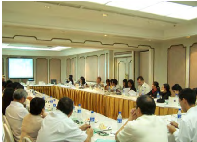
The PDF Sub-Working Group on Water Supply and Sanitation officially convened on September 4, 2008

Subsequently, the group endorsed the proposal to spin