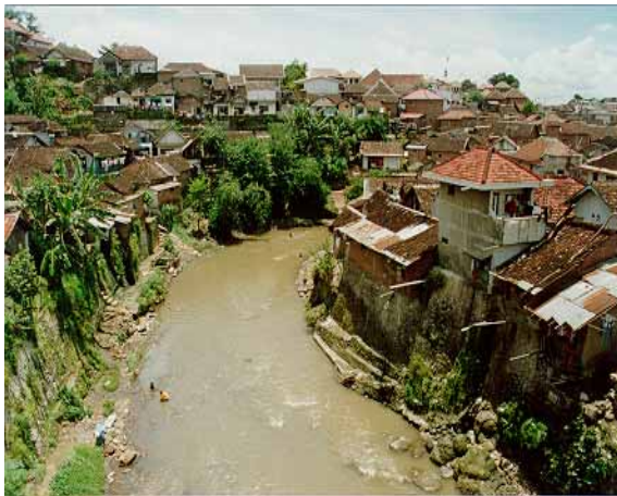
Typical Riverside Low Income Community

Malang, like most medium-sized cities located in the hilly areas of Java, has fairly deep river valleys dividing the urban area. Most of the older parts of the city have been built on ridgelines; the newer parts, especially lower income areas, are spread along the river valleys where land is "available". In general, riverside locations make disposal of human waste physically easier than on the ridges, but not necessarily healthier or more environmentally responsible. 3