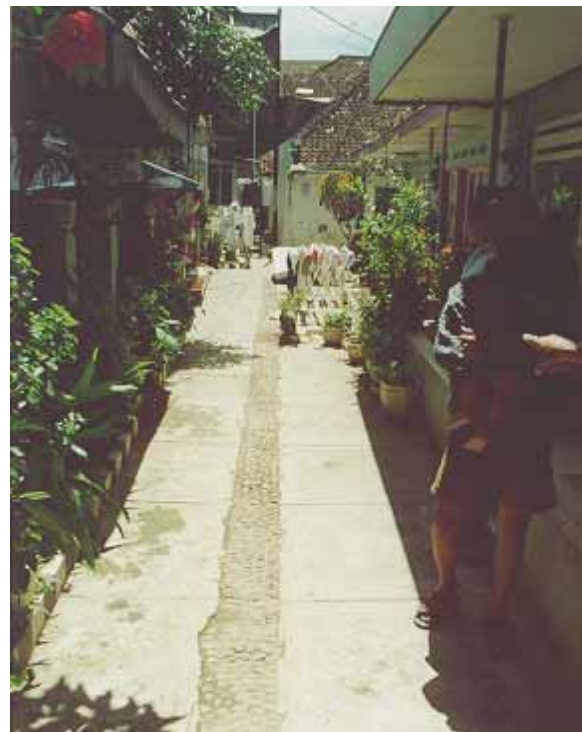
Tlogomas: Main pipeline laid in lane.