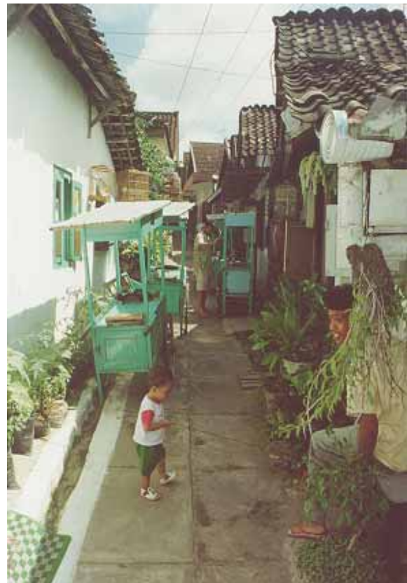
Malang - Congested housing in a poorer neighborhood