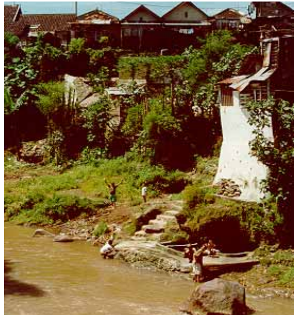
Brantas River - multiple uses: bathing, washing, and open-air toilet