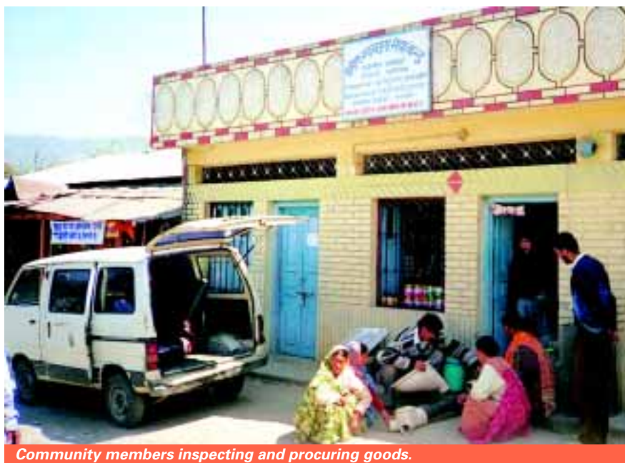
Community members inspecting and procuring goods.

Perhaps the biggest single quality assurance check in the community contracting system is the transparency of the entire operation. When the detailed project report is being drafted, community members decide the brand of all non-local material (mainly pipes, cement and steel) to be purchased and nominate two representatives to the purchase committee. The purchase committee conducts a market survey of manufacturers stocking ISI stamped material and collects invoices from them. The cost of local materials, labor and cartage is approved by