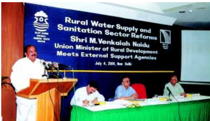
Shri M. Venkaiah Naidu, Union Minister of Rural Development, addressing the gathering.

In his address, Shri Venkaiah Naidu stated that the Government is committed to ensuring complete coverage for drinking water supply, and that it is the responsibility of the Government to create a suitable environment for ensuring an equitable, sustainable, and efficient supply of drinking water to all. To achieve this objective, the 'top-down' approach may not be effective and it is therefore necessary to promote a bottom-up approach, which is demand-responsive and based on the