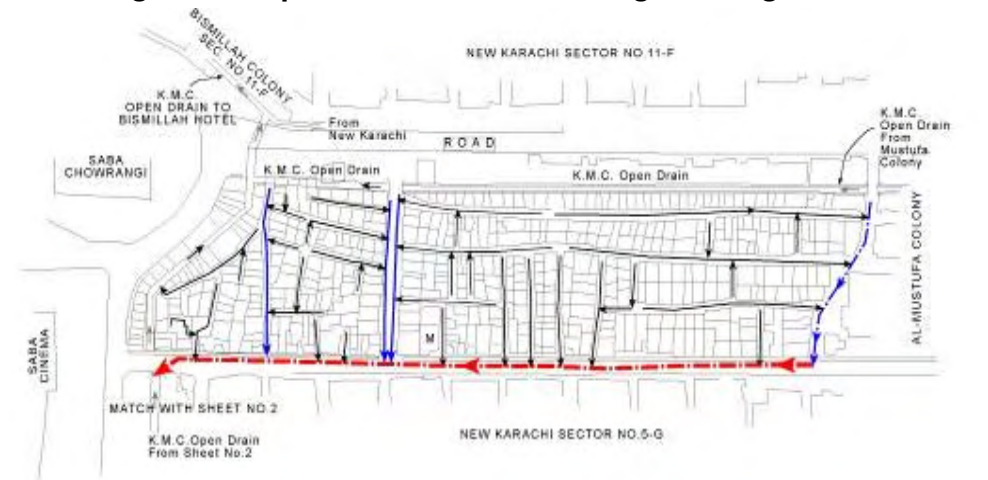
Figure 1: Map of a settlement showing sewerage lines