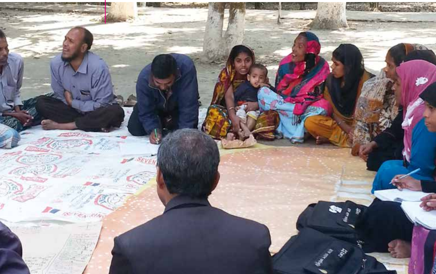
VWC members take turns in drawing households for QIS sample

At the end of each programme year, thirty gender-balanced teams (each with one male and one female staff member) collect data on process performance and behavioural change (outcomes). This is done in a representative sample of sub-districts, VWCs and households, using the BRAC WASH Qualitative Information System (QIS). The QIS was developed by regional and programme managers and staff from BRAC's WASH internal monitoring unit together with specialists from IRC. It quantifies 15 process and behavioural change (outcome) indicators through a set of 15 progressive scales on sanitation and