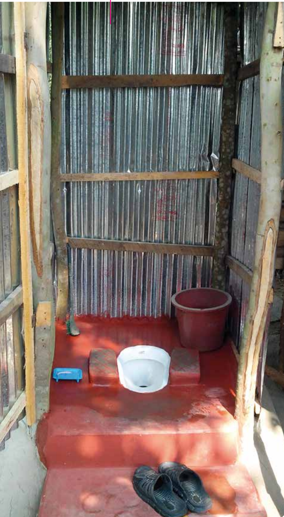
Low-cost handwashing station in toilet in Bangladesh

water well and 14% fewer women from ultra-poor households could demonstrate best drinking water management practices than the non-poor households (Jacimovic et al, 2014).