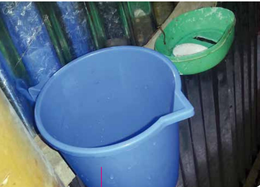
Low-cost handwashing station in toilet in Bangladesh

In 2007, BRAC adopted a gender policy and guidelines to help realise gender equality in its programmes and organisation. The goals are to promote gender equity and equality within the organisation, equally serve the needs of women and men and help eliminate all forms of discrimination against women. In the WASH programme, BRAC is working on gender equality through the empowerment of women and the transformation of gender relations within village households and communities, and within BRAC. The programme proposals mentioned gender mainstreaming as one of the cross-cutting strategies. They also contained gender analyses of women's and men's roles related to WASH practices and decision making. Both WASH I and II proposals contained gender indicators.