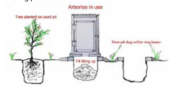
Fig. Schematic illustration of Arborloo and its use