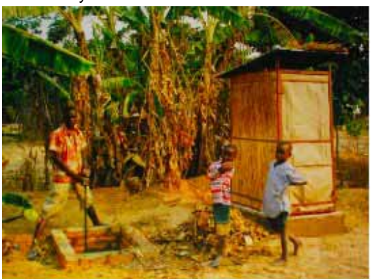
Figure. Fossa Alterna

If there is limited space on the compound or moving latrines is not preferred then it is possible to make two permanently sited pits and alternate between them at yearly intervals. The fertile compost can be dug out and used on the garden once a year. This is a system called the Fossa Alterna .