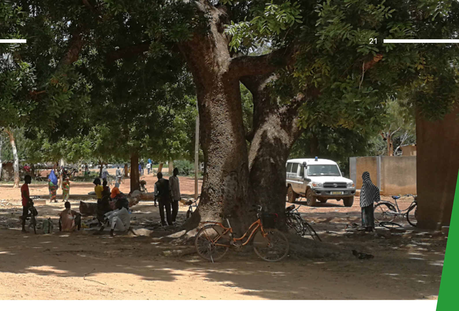
Makalondi commune, Niger

WSUP Advisory: Water and Sanitation for the Urban Poor's UK-based consultancy. They are a global thought leader and advocate who work side by side with service providers to deliver improved water and sanitation services in urban areas. It supports the rural Mid-Western Umbrella utility in Uganda to professionalise its services to secondary towns.