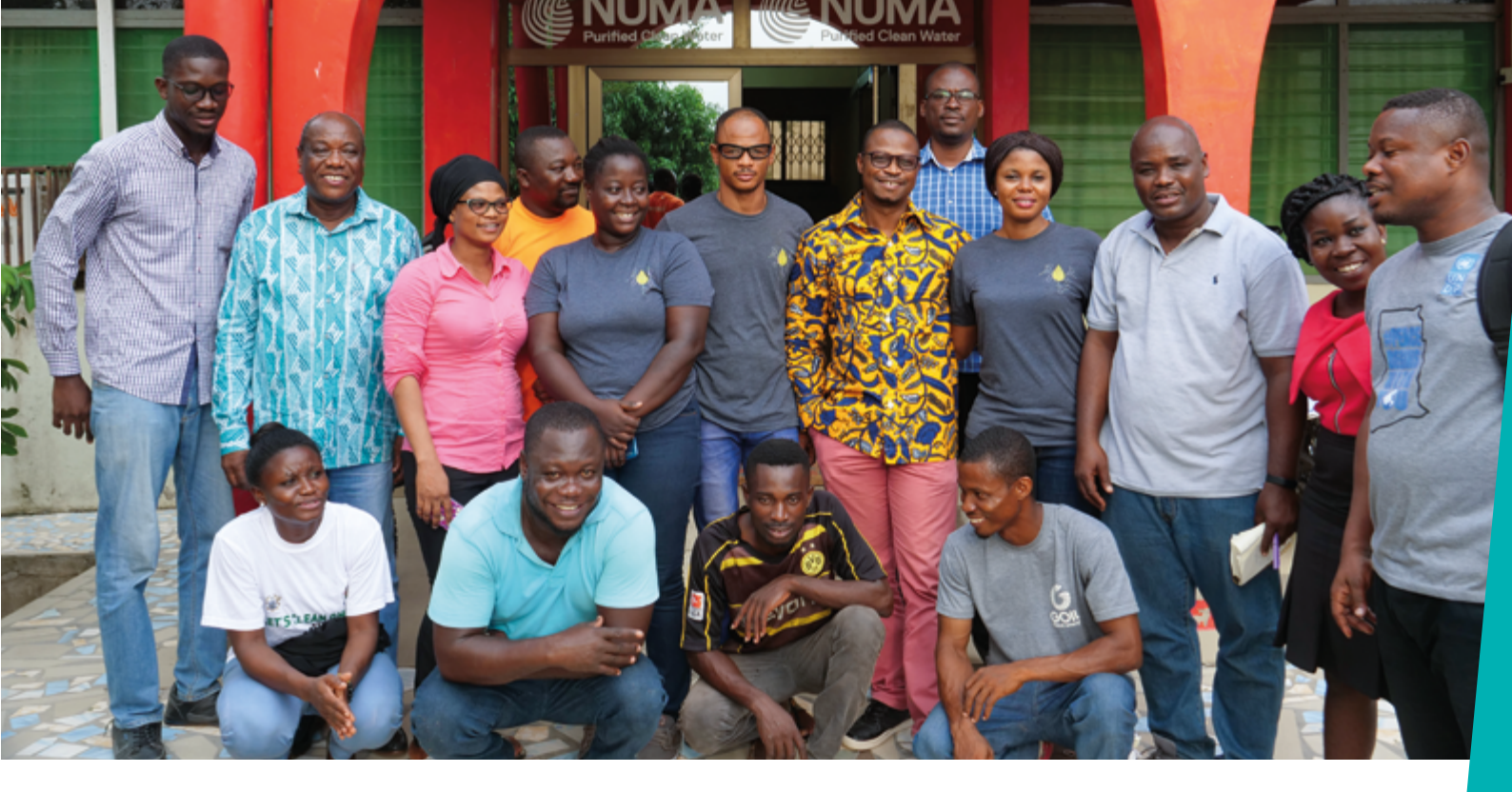
Water4, Access Development Limited, IRC and partners during a success story documentation visit supported by the National Development Planning Commission in February 2020 in Wassa East, Ghana

to those willing and able to pay. Either solution allows the district to channel its scarce resources towards those who need them most, i.e. the very poor, or those who live in remote and underserved communities.