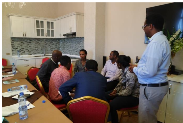
AAEB and NGO staff talking at the workshop.

This report is based on the analysis of the workshop outputs, as well as follow-up interviews with relevant NGOs in January 2018 that were identified as relevant during the workshop. Ten NGOs participated in the workshop, and seven organisations were available for interviews, bringing the reach of this study to 17 NGOs. The additionally interviewed organisations were Cheshire Foundation (CF), Ethiopian Orthodox Church Child and Family Affairs Organization (EOC – CFAO), Future Hopes Integrated Development Organisation (FHIDO), Islamic Relief (IR), Mothers and Children Multi-sectoral Development