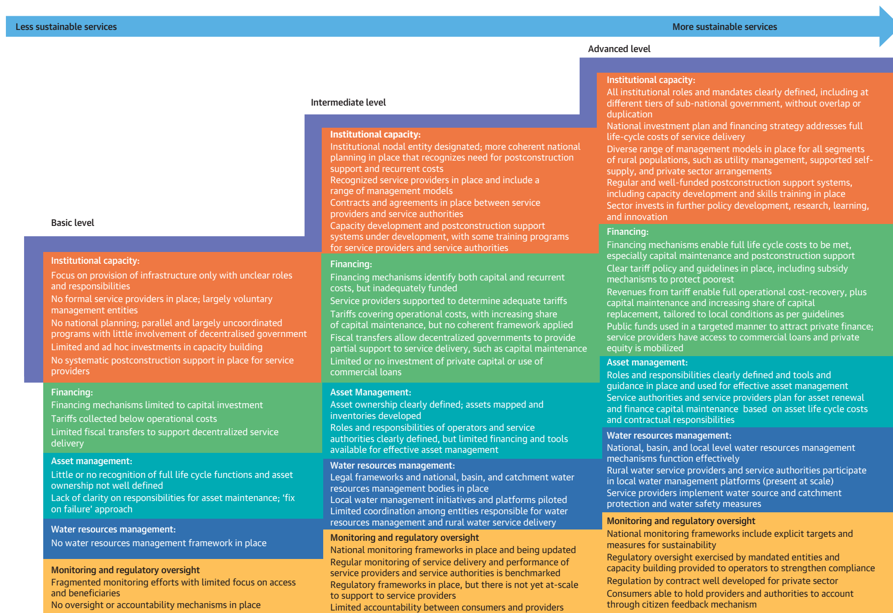
FIGURE 3. Basic, Intermediate, and Advanced Stage of Sector Development towards Sustainable Rural Water Services